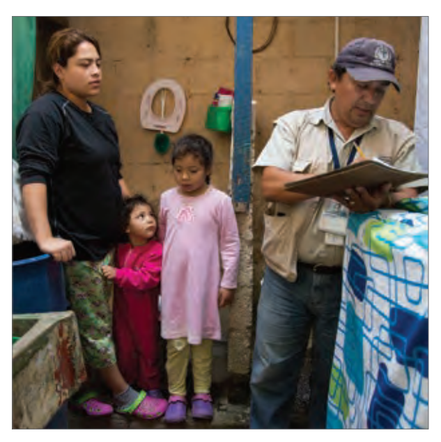
In Guatemala, a governmental relief worker checks this family's living quarters for potential mosquito breeding.

For an outbreak to occur, the mosquito bites an infected person during the first week of infection when the virus swims in a person's blood. The infected mosquito lives long enough to bite again. This cycle continues multiple times to start an outbreak. Typically, A. aegypti live two to four