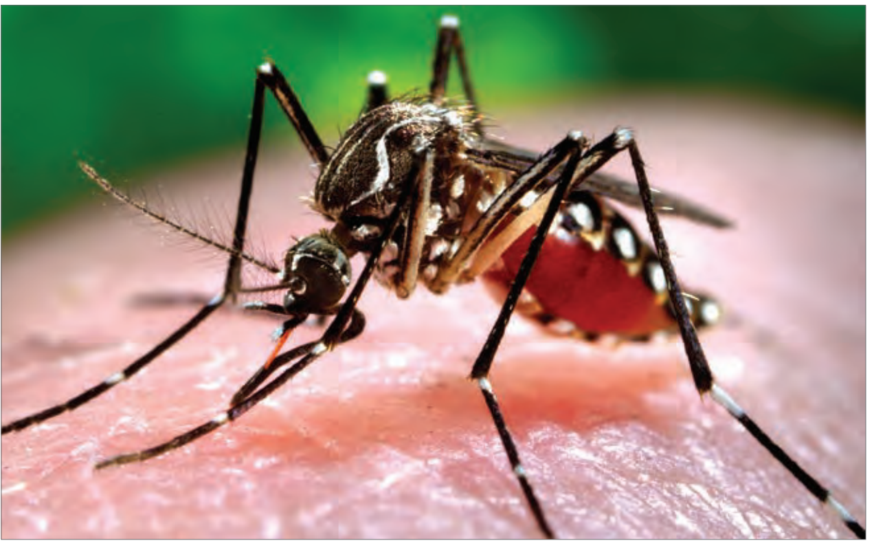
This close up of the Aedes aegypti mosquito shows a distended abdomen after feeding.

Zika appears to attack fetal brain cells key for brain development, but why one twin was spared