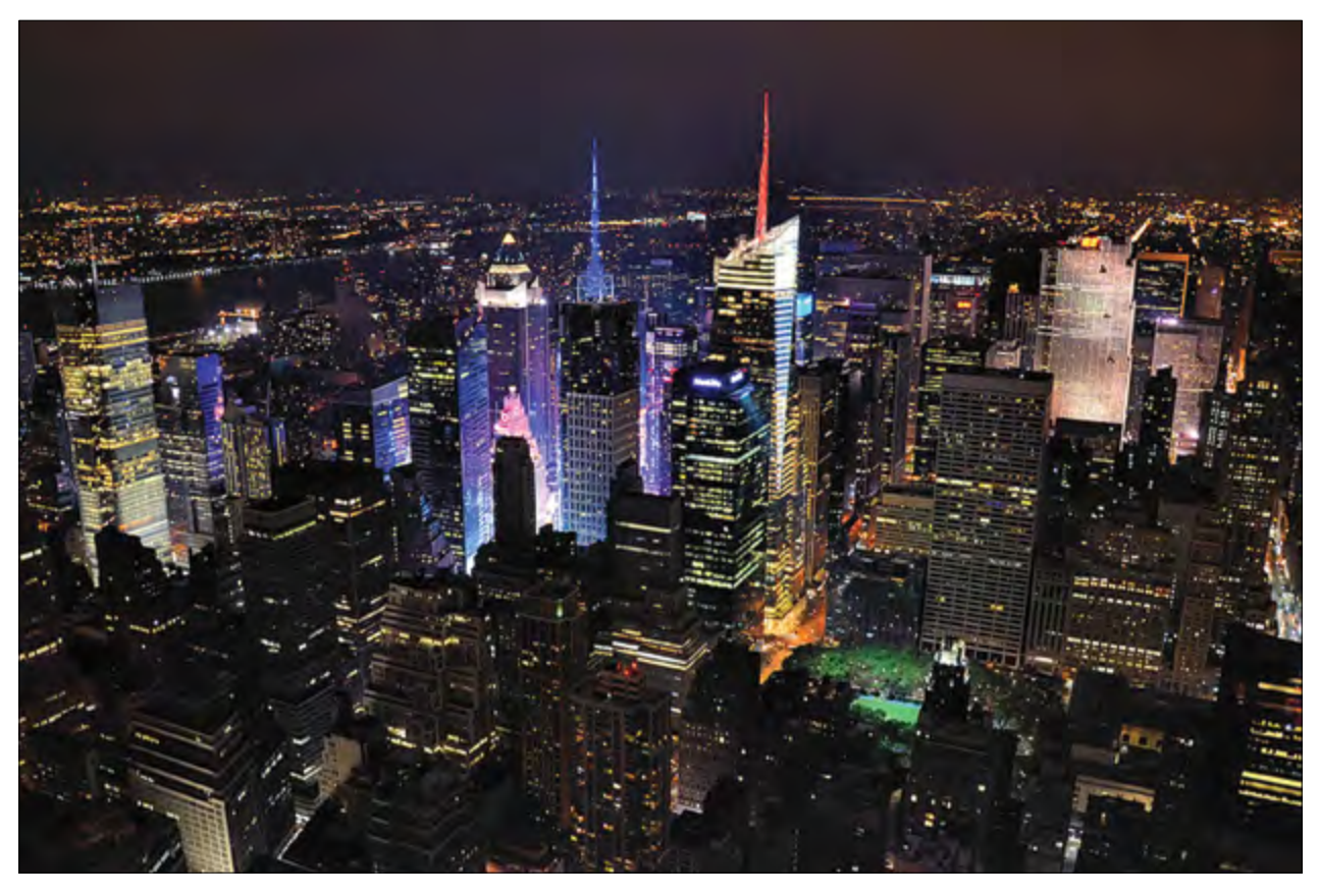
New York City shines brighter than any other U.S. city at night. Nighttime lights can indicate relative economic prosperity.

It is no coincidence that New York City is also one of the top economic centers in the world. Economists first connected economic activity with night lights when the U.S. Department of Defense released satellite images of worldwide lights in the 1970s. Adam Storeygard, an economist at Tufts University, said, "When the satellite lights data were declassified in the 1970s, researchers published papers showing pictures