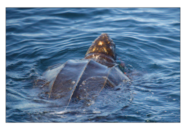
Leatherback sea turtles have a thick layer of ridged, leathery skin on their backs instead of a bony shell, so researchers needed to develop safe ways to attach satellite tracking equipment.

"This work relates fundamentally to the leatherback's status as an endangered species," James said. "We need a context in which to look at leatherback behavior and discover what we can do to help them recover." Knowing when leatherbacks leave or return to an area may aid conservation regulations and promote changes in fishing practices, particularly in near-shore environments where turtles forage and are most at risk. James collaborated extensively with fishermen, and is mindful that simple solutions, such as closing off entire areas, are not always the