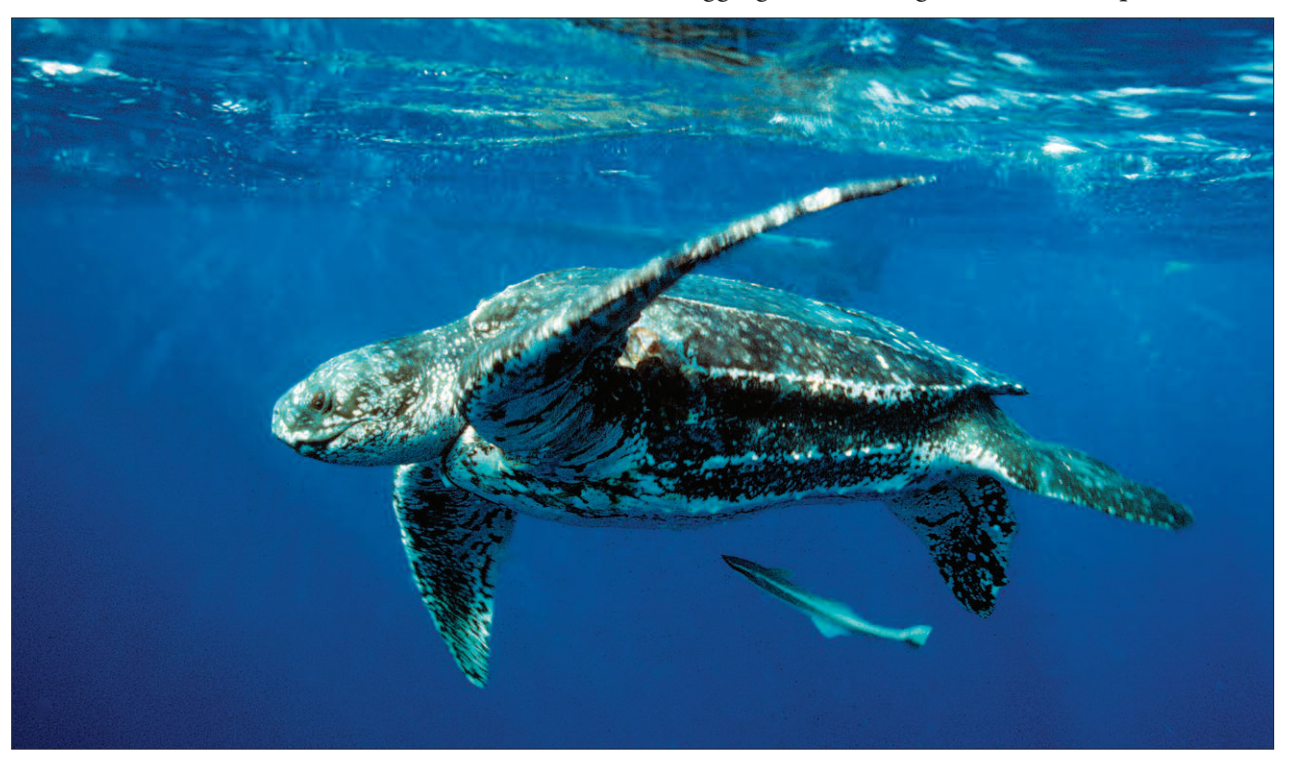
Atlantic leatherbacks are the largest species of sea turtle. While they have few natural predators, they often become entangled in fishing nets and drown. Leatherbacks were declared critically endangered in 2000.