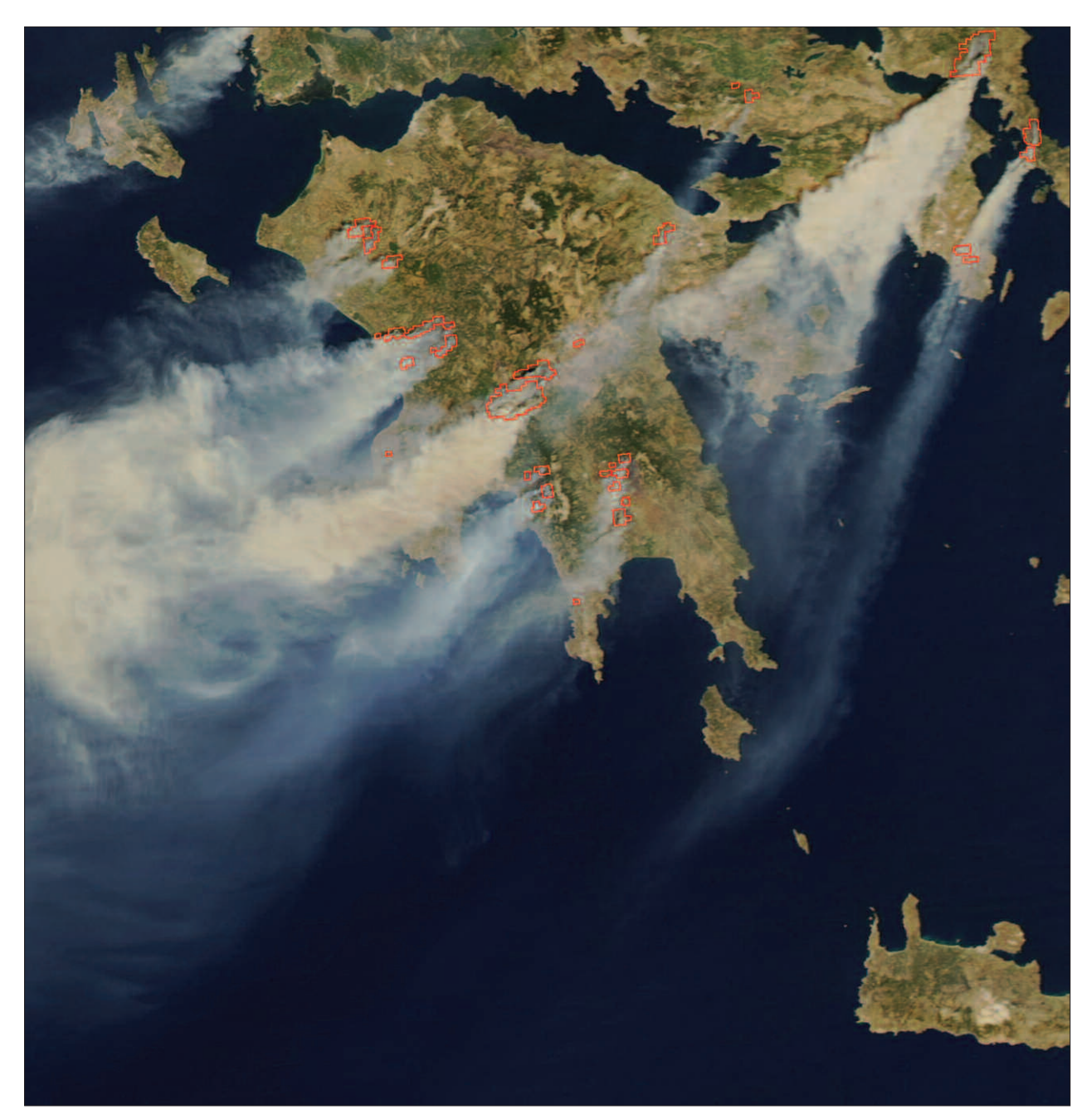
Smoke from forest fires in Greece on August 25, 2007, is evident in this satellite image from the Moderate Resolution Imaging Spectroradiometer (MODIS) instrument. The active forest fires, outlined in red, occurred in the Peloponnese and Attica regions, and on the island of Evia. Long-range smoke plumes from Evia extend west over the city of Athens toward the Ionian Sea.

To find out if the pollution episodes could be traced to the fires, Liu first needed to know if smoke plumes from the fires had drifted to Athens. Liu checked for smoke plumes using true color satellite images of Athens and the vicinity