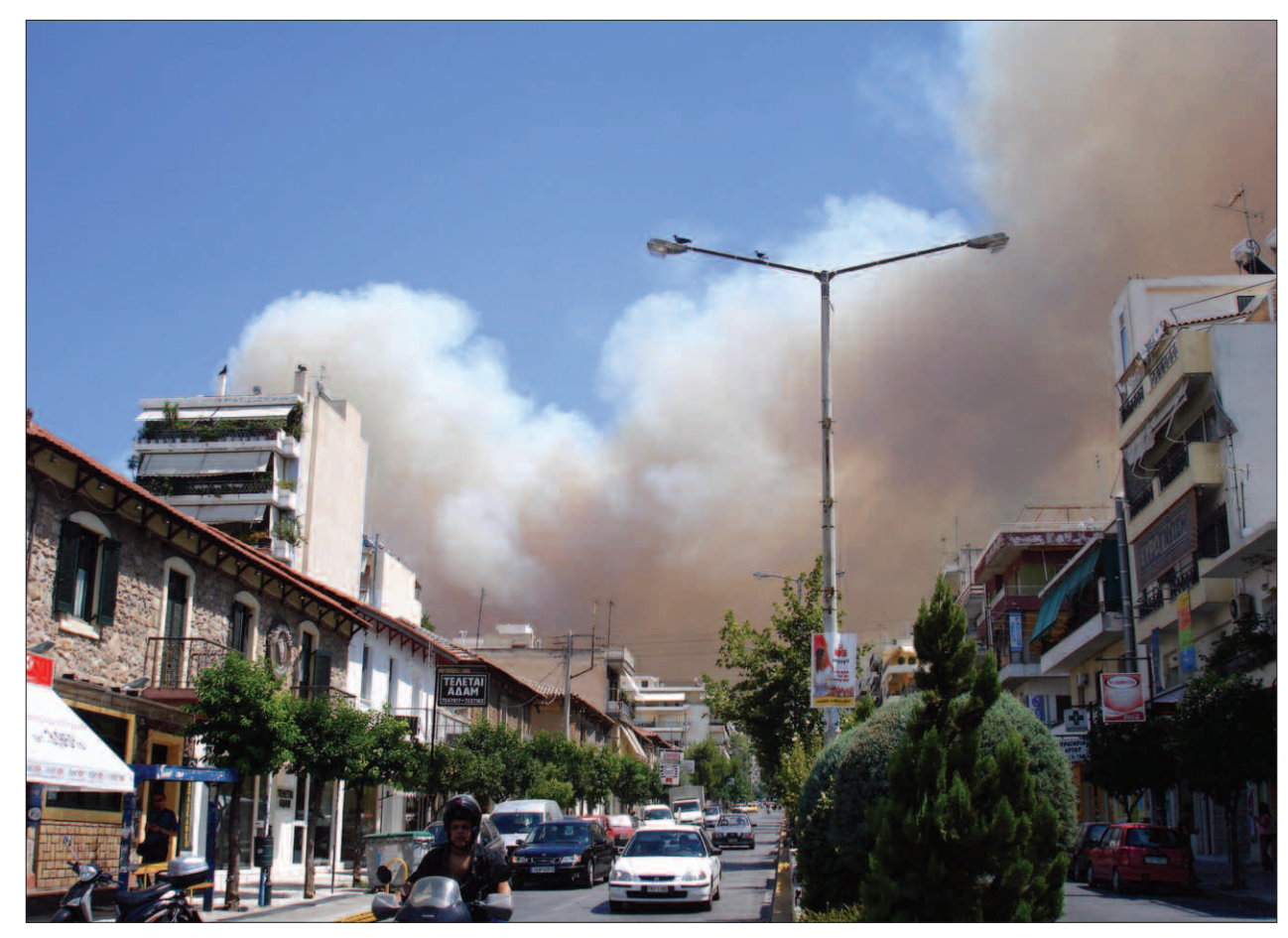
Smoke obscures the midday Athens sky in this August 25, 2007, photo. A portion of the forest on Mount Hymettus was burning.

from the Moderate Resolution Imaging Spectroradiometer (MODIS) instrument on the NASA Terra and Aqua satellites.