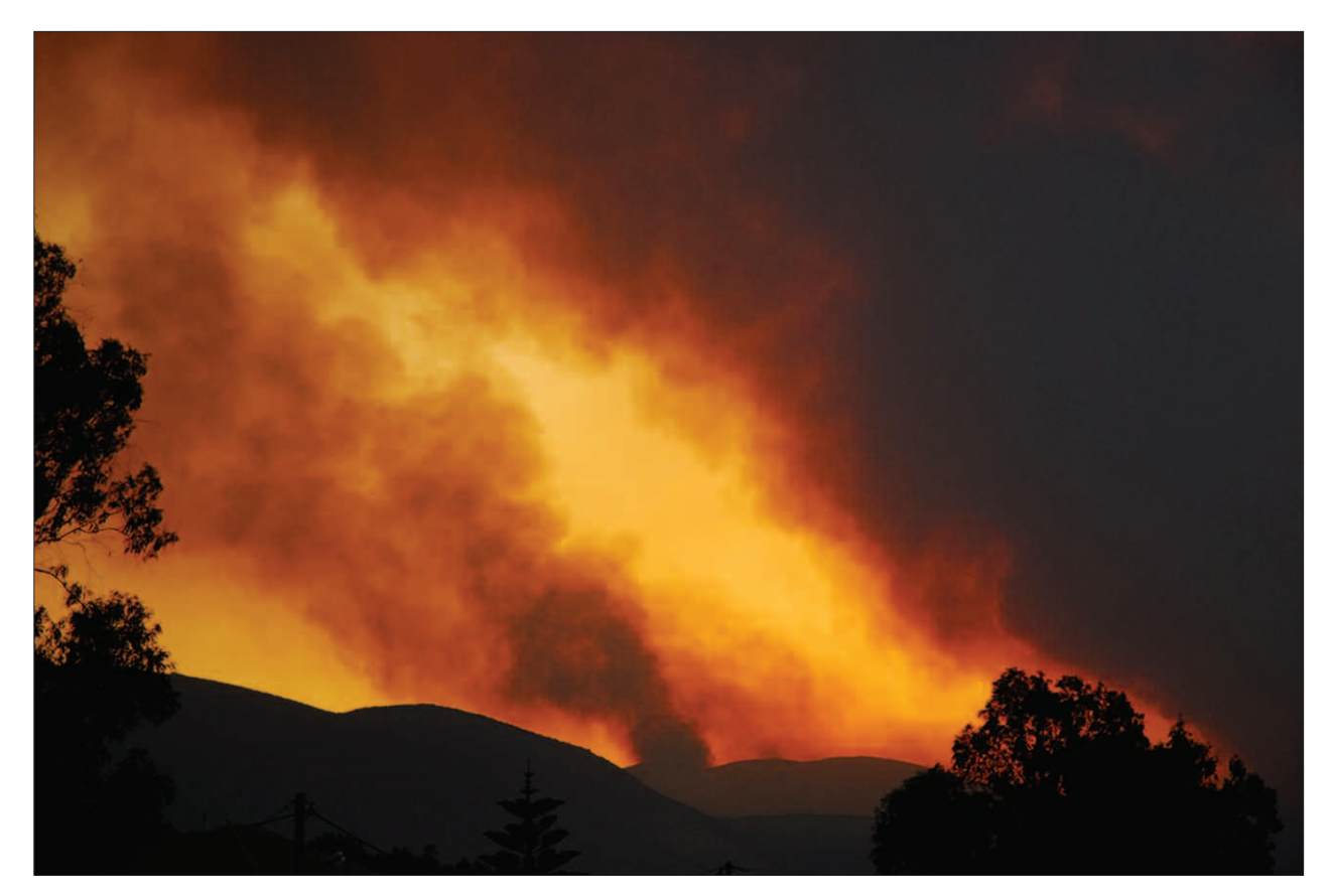
A forest fire burns on the island of Zakynthos in Greece on the evening of July 25, 2007. Heat waves, a strong wind, and arson caused many fires in Greece that summer, adding smoke plumes to an already polluted skyline.

What Liu and Kahn found out surprised them. The combination of aerosol type data showed that during the first episode, the average