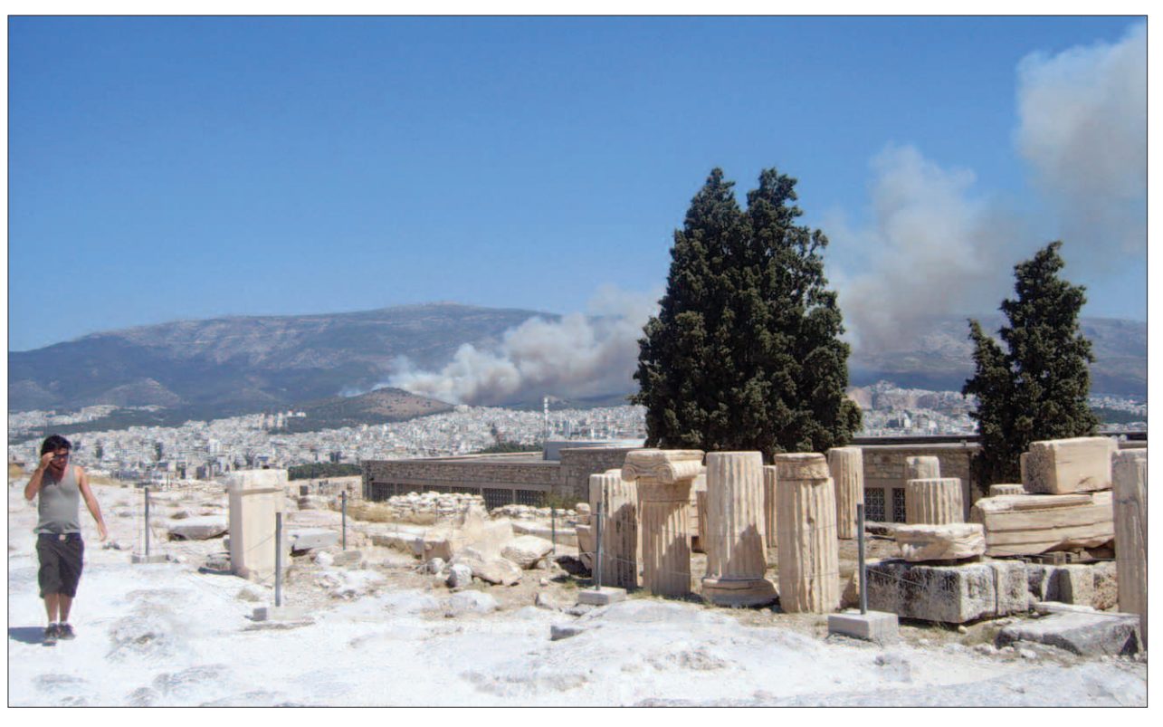
A man walks through the Acropolis while smoke plumes billow from a forest fire near Athens on July 25, 2007. More than 3,000 forest fires burned in Greece that summer, mostly in areas where there were no ground instruments to observe the impact of the smoke on air quality.

Athens is already one of the most polluted cities in Europe, more so in the summer when humidity and the intense Mediterranean sun heat up industrial and vehicular pollutants lingering in the atmosphere. Did the forest fires cause the city's air pollution levels to get worse? Researchers in Greece could not answer this question easily. Most of the fires burned in rural areas where there were no ground-based instruments to measure pollution. The fires also produced gigantic smoke plumes that blew