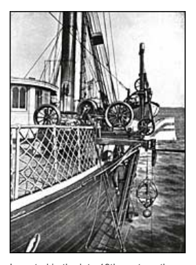
Invented in the late 19th century, the Sigsbee Sounding Machine was the first efficient piano wire sounding instrument. The basic design of ocean sounding instruments remained the same for the next 50 years. Image courtesy of the NOAA Photo Library (A new browser window will open.)

During its first six months of flight, the Jason-1 satellite was placed along the same groundtrack as TOPEX/Poseidon, about one minute apart. Because the two satellites observed nearly identical ocean conditions, scientists could then calibrate the new instruments on Jason-1. Once scientists confirmed that Jason-1 was taking measurements with equal or better accuracy than its predecessor, TOPEX/Poseidon was