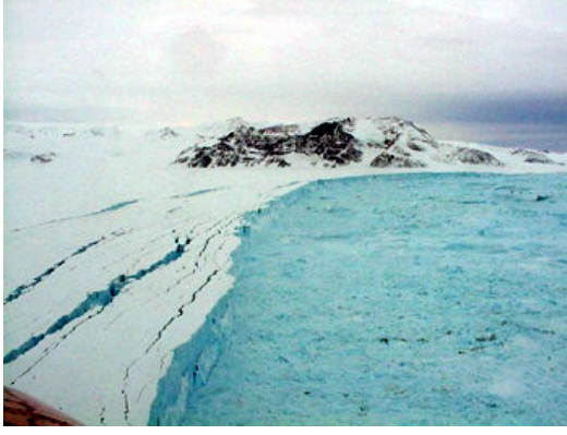
Cracks lined the remaining Larsen B Ice Shelf south of the Seal Nunataks on March 13, 2002.

Unlike the melt water fracturing theory, which is easy to monitor using satellite images, other theories require in situ measurements that can be difficult to obtain. A crewmember of the British Antarctic Survey research vessel, James Clark Ross , photographed the aftermath of the Larsen B breakup. But according to Vaughan, it was pure luck that the ship happened to be in the area. "Most ship research schedules are determined years in advance, making it virtually impossible for researchers to obtain a ship on short notice. In addition, not all ships have helicopter facilities, meaning researchers can't be flown ashore," he said.