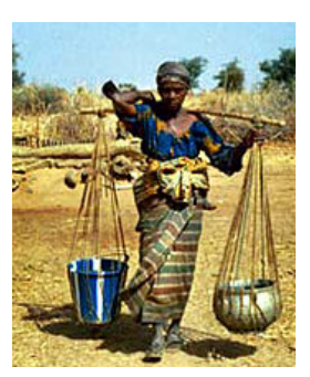
Water is scarce in the African Sahel. This Nigerian woman makes her daily trip home carrying two pots of water and a baby on her back.

Population Series: Location, Location, Location Life on the Brink Measure by Measure