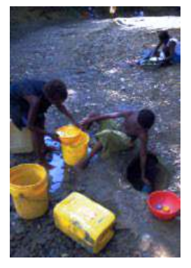
Untreated water from suspect sources is a widespread problem in South America. (Image courtesy of National Institutes of Health. A new browser window will open.)