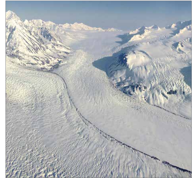
Meltwater from mountain glaciers, such as Knik Glacier in Alaska, contribute a full third of sea level rise. Alaska's glaciers cover approximately 88,000 square kilometers (34,000 square miles).

Researchers also must tackle unique obstacles posed by regional climates. A variety of satellite instruments can monitor glacier speed, but few can see through cloudy, wet weather. Because Alaska gets a lot of rain, Burgess chose data from the Phased Array type L-Band Synthetic Aperture Radar (PALSAR) instrument on the Japan Aerospace Exploration Agency and Ministry of Economy, Trade and Industry (JAXA/METI) Advanced Land Observing Satellite (ALOS). The ALOS PALSAR data, although copyrighted by JAXA/METI, are made available through the Alaska Satellite Facility Synthetic Aperture Radar Distributed Active Archive Center (ASF SAR DAAC) to NASA scientists due to the strong partnership developed between JAXA and NASA. Burgess said, "L-Band radar, such as used by ALOS, is less sensitive to water, which allows us to track the glacier over a longer period of time. It makes the algorithm more robust to changes in weather." Tracking the glaciers with