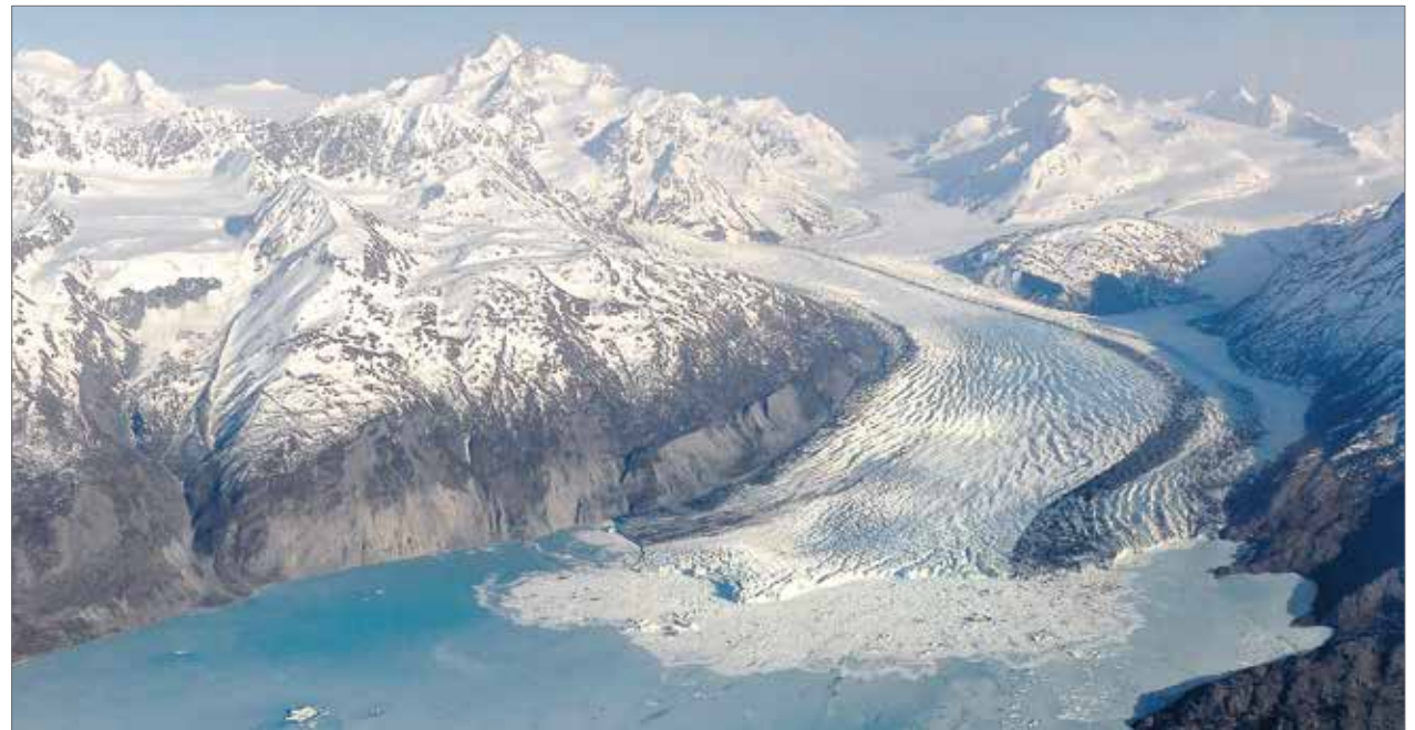
Mountain glaciers, such as Colony Glacier in Alaska, often terminate in a lake.