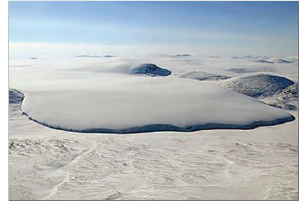
The NASA IceBridge mission continues to survey the Barnes Ice Cap on Baffin Island. This remnant of the Laurentide ice sheet belies its once massive size, when it covered all of Canada and parts of the northern U.S. Sudden shifts in deep ocean currents may have initiated past ice ages.

“Aquarius picked up the signal, so that was a pleasant surprise,” Gierach said. But there was something else, the extent. “This wasn’t just