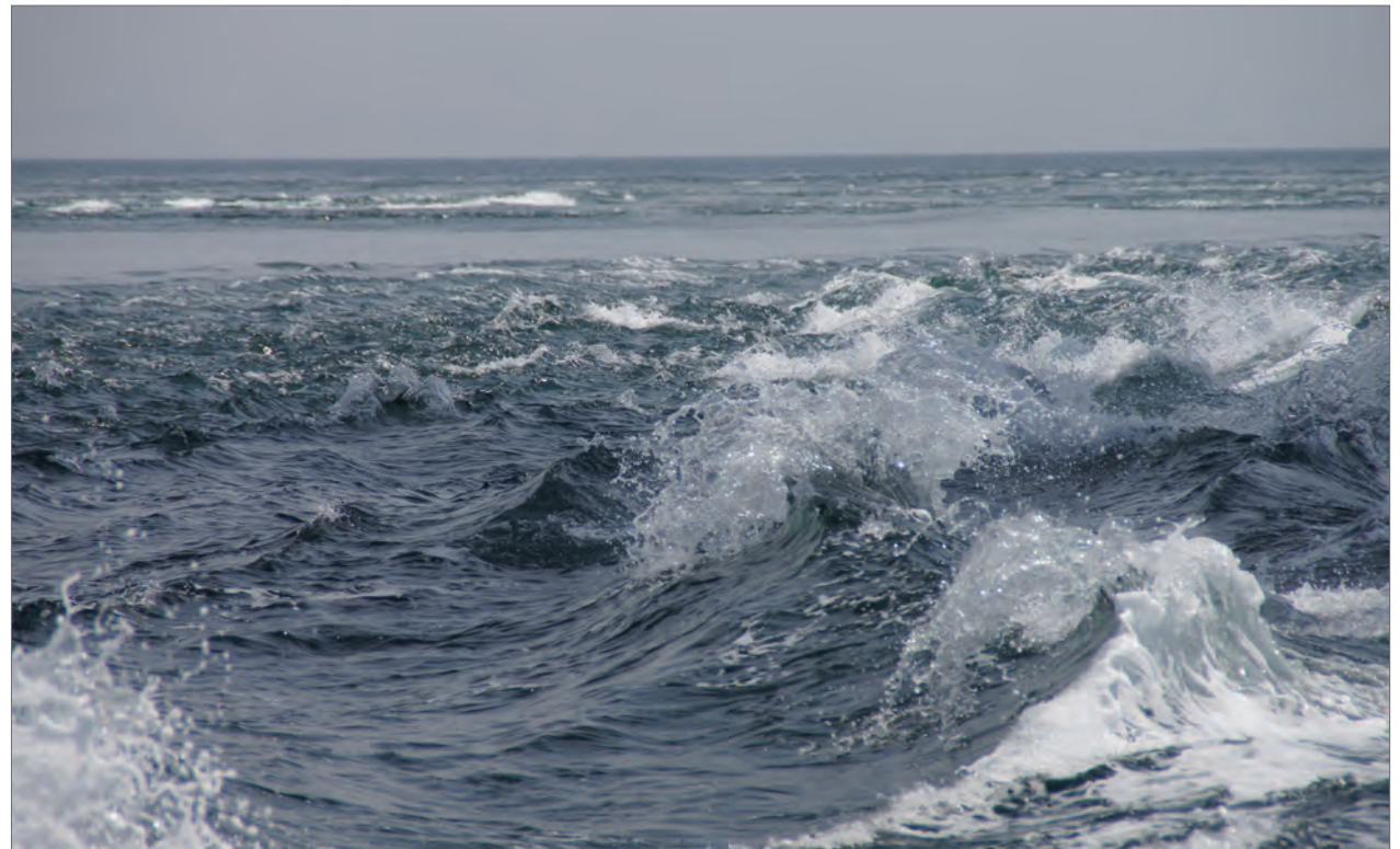
In Naruto, Japan, a boundary between different water masses appears as a sliver of still water beyond turbulent waters. The stratification of disparate densities creates varying momentums within the ocean waters.

Though the science in the film is flawed and the events exaggerated, scientists acknowledge that if enough freshwater dumps into the North Atlantic Ocean, the large-scale Atlantic Meridional Overturning Circulation that transports heat from the tropics to the North Atlantic could slow down and potentially lead to colder climate in Europe. The actual mechanisms behind the