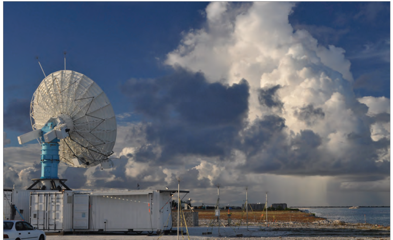
A weather radar sits on a shipping container on Addu Atoll in the Indian Ocean where the Madden-Julian Oscillation spawns. Convective clouds form in the background.