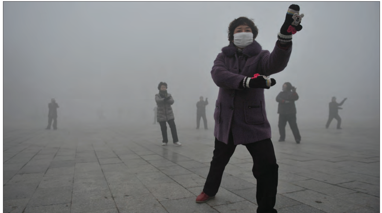
Retirees perform tai chi during a smoggy day in Fuyang, China in January 2013.