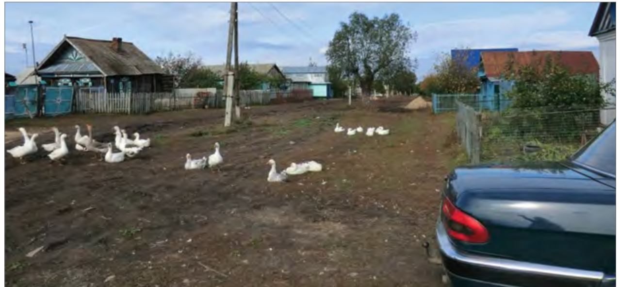
Geese roam about on a typical farm in the Samara region in Russia. Many farms in Russia are in remote areas hundreds of miles from major cities, and may lack modern amenities such as telephones and television.