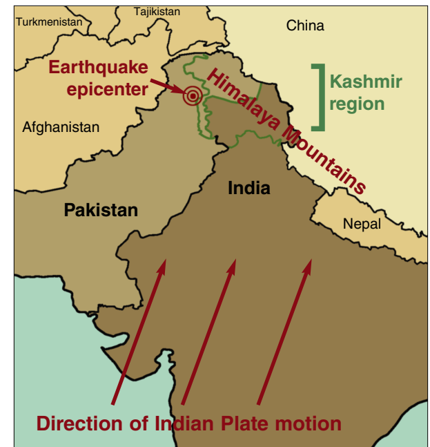
The 2005 Kashmir earthquake displaced more than three million people, primarily affecting residents in the Kashmir region. Over time, the collision between the Indian and Eurasian plates formed the Himalaya Mountains, and has made the region seismically active and susceptible to earthquakes. (Courtesy L. Naranjo, based on United Nations map)

Because of the difficulties of ground surveying, researchers like Avouac are investigating how