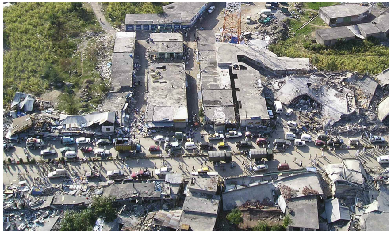
The 2005 Kashmir earthquake badly damaged the town of Balakot in northwestern Pakistan. Debris littered walkways and roads, making relief access difficult.

Kashmir also inhabits another crossroads: It lies atop a web of active faults with underground dynamics that rival the complexities above ground. On October 8, 2005, one of the faults gave way, resulting in a magnitude 7.6 earthquake. In a matter of seconds, the rugged terrain that lures travelers became a disaster zone that soon would host relief workers providing food and shelter, military rescue operations airlifting supplies, and scientists seeking to understand how the earthquake happened.