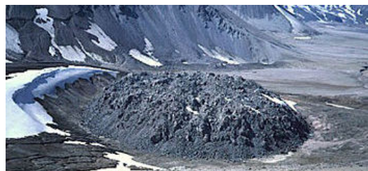
A volcanic lava dome forms when lava erupts slowly and accumulates over the vent rather than flowing away.