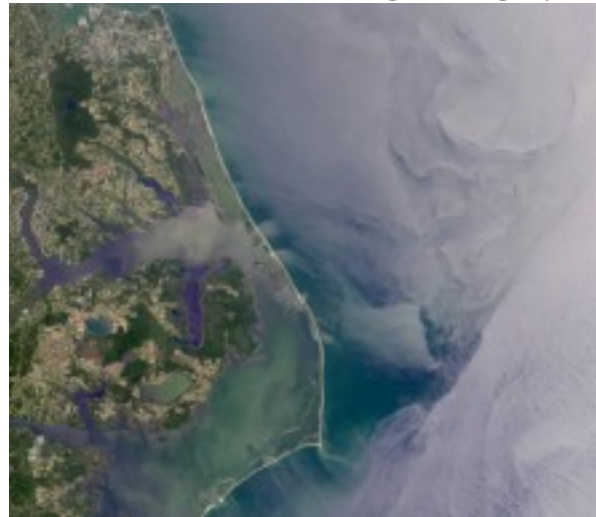
Data Products through Imagery (PDF)