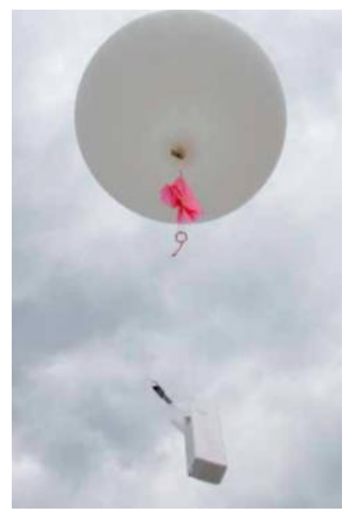
Figure 2: Radiosonde on a weather balloon