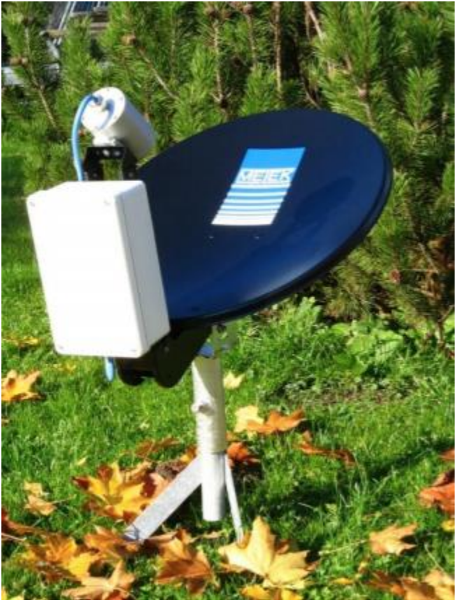
Figure 2: Image of the MRR-2 instrument

The MRR-PRO combines the unique MRR technique of the MRR-2 and a high performance processing unit which significantly improves all operating parameters. The system allows precise measurements of the Doppler spectra caused by hydrometeors and yields the rain