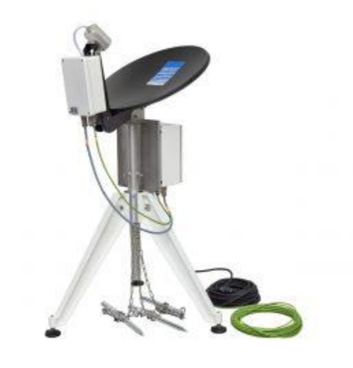
Figure 3: Image of the MRR-PRO instruments