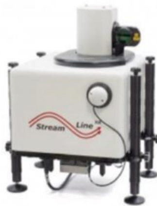
Figure 2: SBU Doppler LiDAR

The DL is a small self-contained system that is easily portable and has relatively modest power requirements. The instrument is housed in a rugged environmentally controlled container, requires only external electrical power and internet, and will run unattended for weeks or months on end with little or no operator intervention. Control of the system is facilitated through either a direct connection to the onboard instrument computer or remotely via the internet. The control software enables the user to easily modify a variety of instrument settings and schedule a variety of different scans. More information about this Doppler LiDAR can be found at Doppler Lidar (DL) Instrument Handbook , Doppler Lidar | Radar Science , and ARM Research Facility .