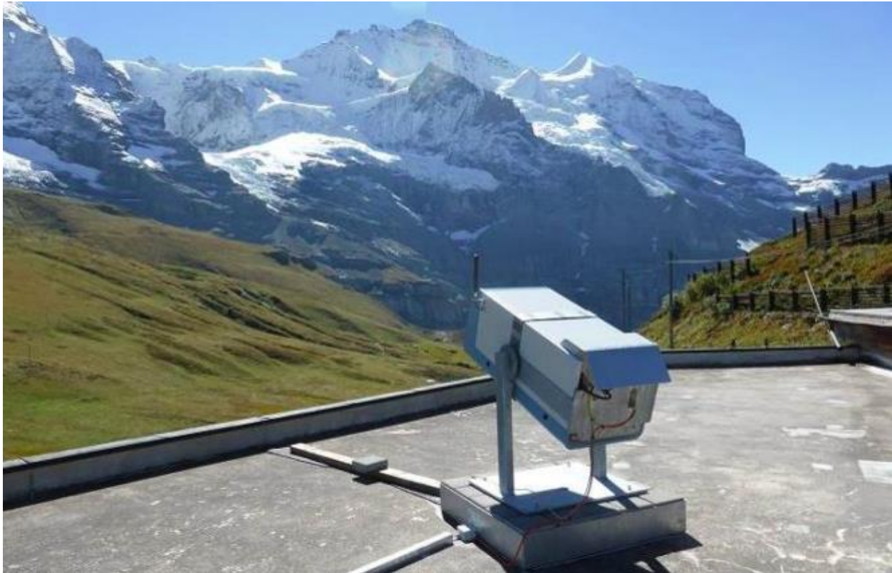
Figure 3: Lufft Ceilometer CGM 15K

Additional information for each ceilometer is available below: