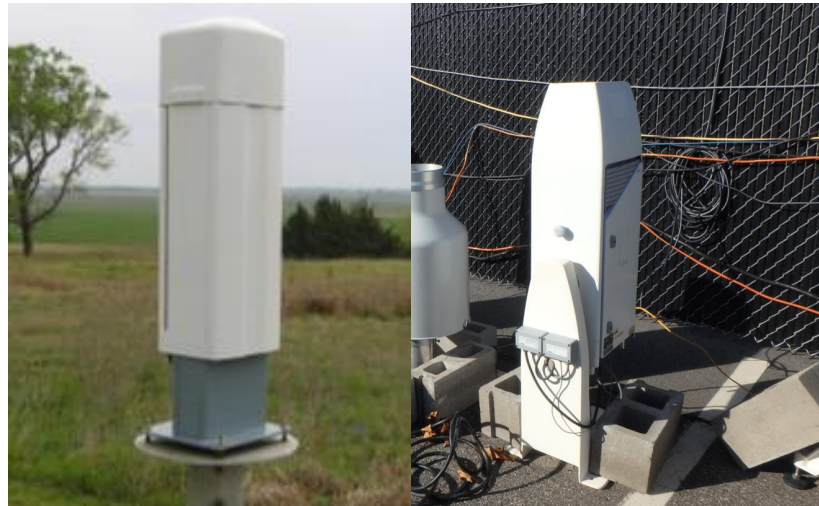
Figure 2: The SUNY Stony Brook Ceilometers: Vaisala CL51 (left) and Vaisala CT25K (right)

The CL51 and CT25K both use a single lens which allows for more accurate measurement at lower altitudes. They are automatic and have self-diagnostic capabilities, allowing them to operate unaided for long periods of time. The CL51 has an altitude range of 15 km while the CT25K has an altitude range of 7.5 km. The CT25K is attached to a pedestal base and can be manually tilted to different tilt angles ranging from -15^{\circ} to 90^{\circ} from the vertical. The CL51 also has a tilting feature. These ceilometers can detect up to three cloud layers simultaneously as well as vertical visibility. Additional instrument specifications are listed in Table 1 below.