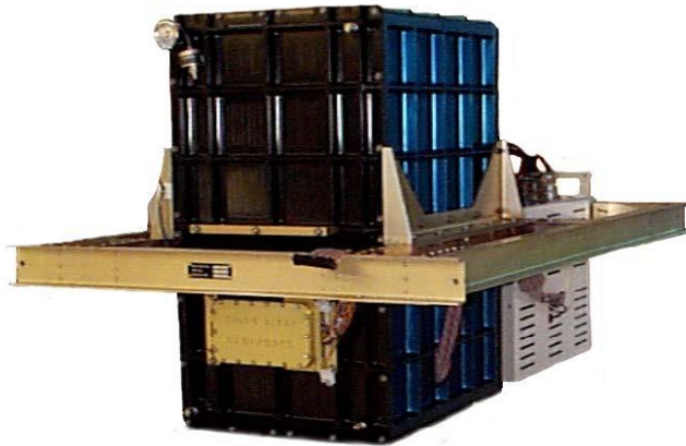
Figure 2: The CPL in aircraft configuration

gather 3-dimensional measurements of an object or environment. It works similarly to radar or sonar technology except that it uses light instead of radio or sound waves. LiDAR works by calculating the amount of time it takes the laser pulses to reach an object and return back to the scanner, allowing for spatial analysis. CPL uses three laser wavelengths (1064, 532, & 355 nm) that operate simultaneously. The instrument has the ability to detect visible and subvisible cirrus clouds and aerosols due to its laser's high pulse-repetition-frequency and low energy pulse, allowing for photon-counting detection. More information about CPL can be found on the NASA Airborne Science CPL webpage and in the CPL Data Applications document .