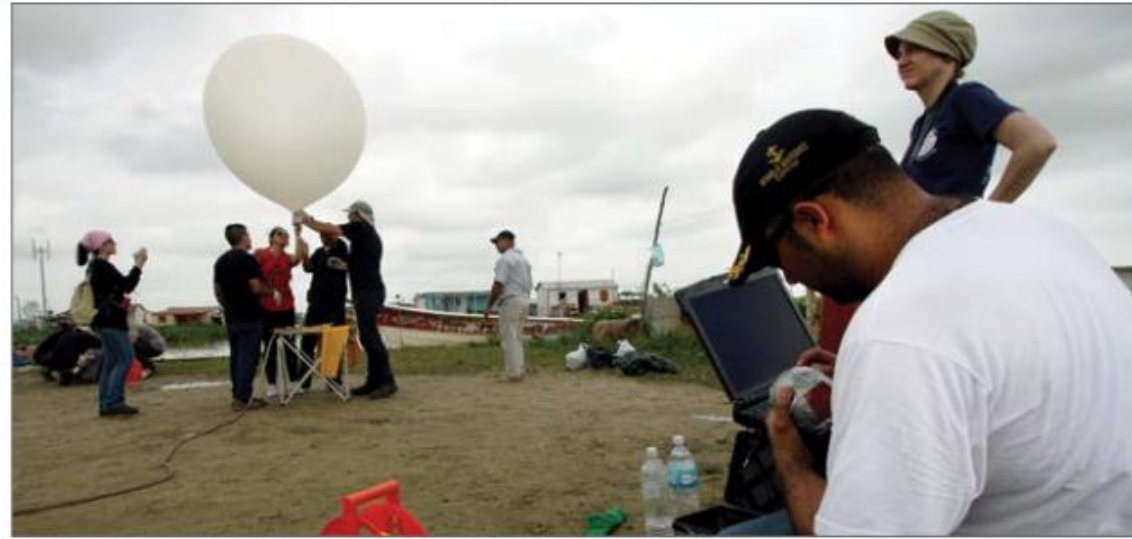
The team works to deploy a weather balloon with sensors attached to measure temperature, relative humidity, and pressure.

All thunderstorms follow a formula: rapidly rising warm air collides with moist air. Unstable air and moisture are key, and Catatumbo Lightning gets a boost from a unique topography. Mountain ridges cup three sides of Lake Maracaibo, leaving a narrow window open north to the Gulf