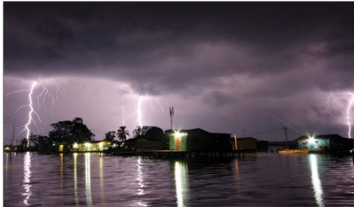
Seen from the shore of Lake Maracaibo, lightning strikes Congo Mirador, a palafito or a stilt house village, near the mouth of the Catatumbo River.