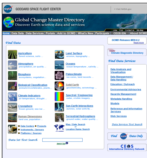
Figure 1. GCMD Homepage